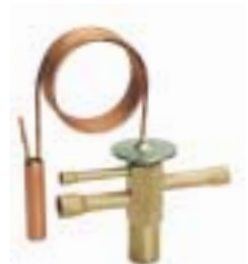
Honeywell TLEX 0.5 - 4.5