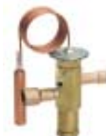
Honeywell TLEX 4.75 - 7