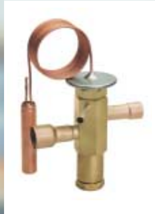
TLEX 4.75 - 7