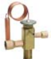
Honeywell TLEX 8 - 11