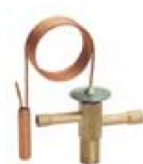
Honeywell TLE 0.5 - 4.5